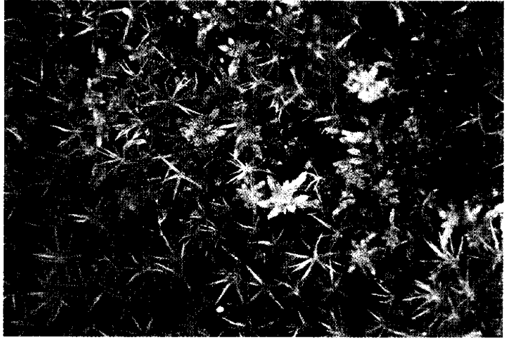
Fig. 2: Sphagnum mosses growing among the nursing polytric mat. The photo was taken on a peatland four years after restoration.

outcompetes the nurse plant, causing its demise (Flores-Martinez et al. 1998, 1994, Barnes & Archer 1999). This replacement holds true for Sphagnum and polytric. Buttler et al. (1996), for example, noted the natural succession from polytric to Sphagnum on a dry bog site in Switzerland. From paleoecological records, we can see that after a disturbance such as peat cutting or fire, there is an initial spread of Polytrichum , but after some time has elapsed, the dominance shifts in favor of Sphagnum (Jasieniuk & Johnson 1982, Foster 1984, Kuhry 1994, Roderfeld et al. 1996, Robert et al. 1999).